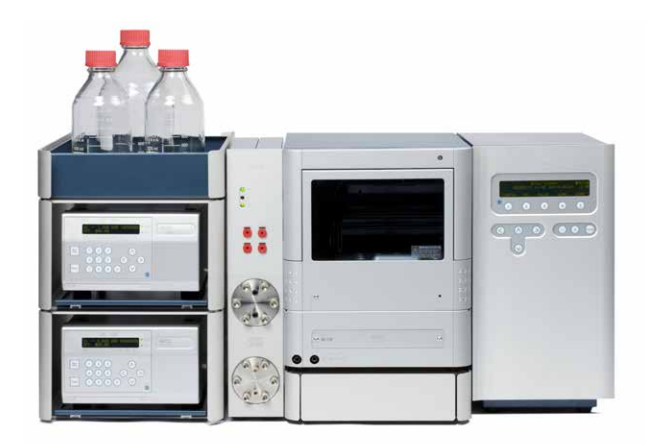
Figure 1: ALEXYS Aminoglycosides Analyzer.

In this application note results are shown for the analysis of Tobramycin and its impurities using the ALEXYS Aminoglycosides analyzer.