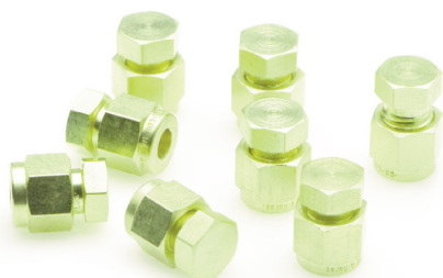
Figure 1: Two-piece brass storage caps.