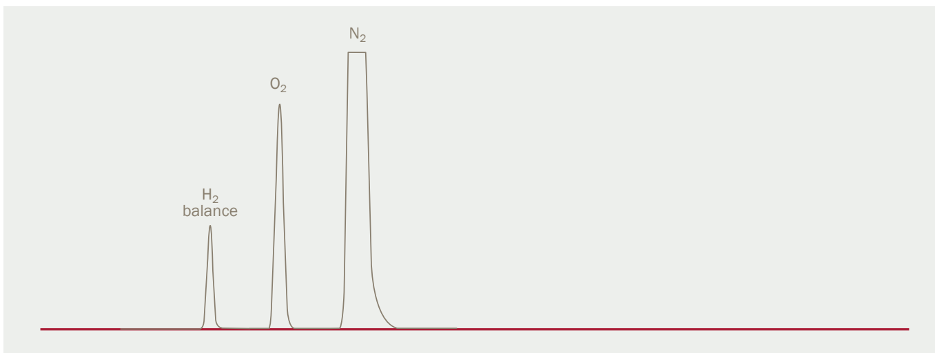
Figure 3 : Chromatogram of traces O 2 - N 2 in a hydrogen matrix using PlasmaDetek-2 in a selective mode.