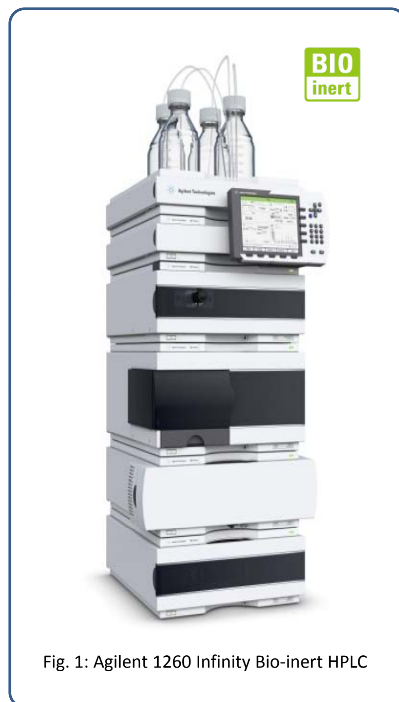
Fig. 1: Agilent 1260 Infinity Bio-inert HPLC