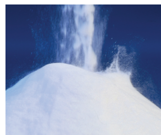
Better Cartridges Using Grace Silica