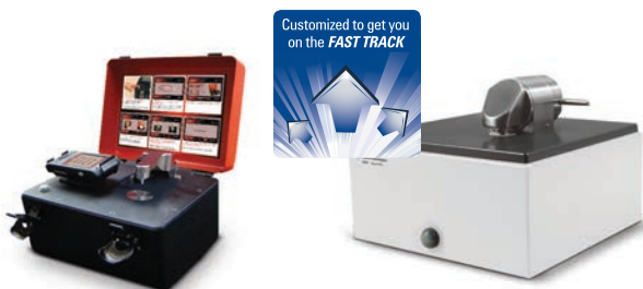
Agilent 4500 Series Portable FTIR