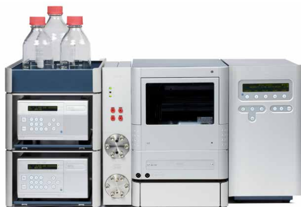
Figure 1: ALEXYS Aminoglycosides Analyzer.

In this application note results are shown for the analysis of Tobramycin and its impurities using the ALEXYS Aminoglycosides analyzer.