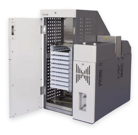
Figure 3: TD-100 automated TD for up to 100 tubes