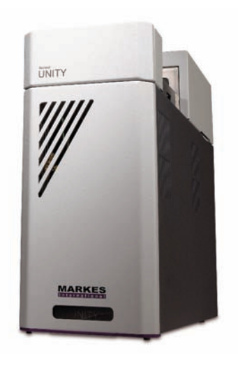
Figure 2: UNITY 2 single-tube thermal desorber

The UNITY 2 TD platform was used here, possibly for the first time in beer analysis, to run a single sample consecutively at two widely differing concentration levels (aliquots) without operator intervention. This was followed by GC/TOF-MS analysis. The results were combined and normalised to a common intensity for interpretation of the entire profile.