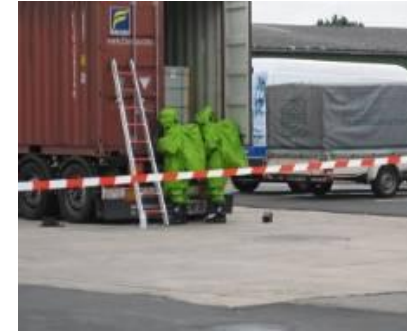
Picture 3: Opening a container under security measures (Fire brigade Frankfurt)

Important! Observing the fast answer of the instrument it becomes possible to measure several containers without interruption.