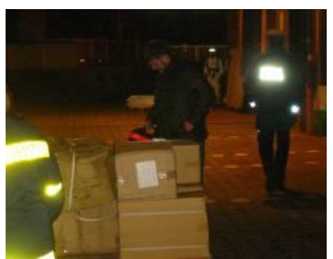
Picture 6: Monitoring the chemical content while unloading the container.

After completing a 2 years study the GDA2 has been in daily use by the Hamburg Customs office' officers for the analysis of containers.