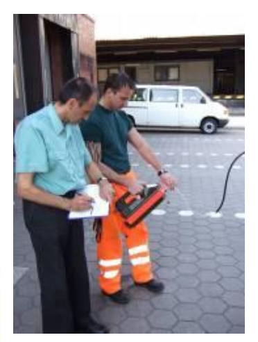
Bild 2: Analysis and protocol of the results shown by the GDA2. (Customs service, Hamburg)

So that the user avoids the contact with the dangerous environment from the container, the measurement has to be done from the outside.