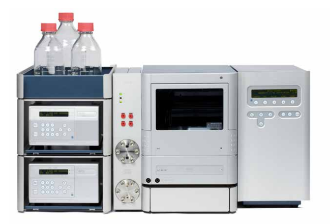
Figure 1: ALEXYS Aminoglycosides Analyzer.

In this application note typical results obtained with the ALEX-YS® gentamicin analyzer based on a C18 column are reported, demonstrating its performance for the analysis of gentamicin.