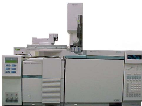
HP6890/5973 with OPTIC2 8270 Injection System

1 USEPA SW-846, Method 8270C, Revision 3, December 1996.