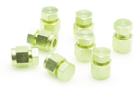
Figure 1: Two-piece brass storage caps.

Sorbent tubes are most effectively sealed with twopiece, brass, ¼" screw-caps with single PTFE ferrules (Figure 1). These types of seal have been demonstrated to ensure minimum ingress of external artefacts and minimal loss of sampled components over storage periods up to 27 months<sup>1-3</sup>.