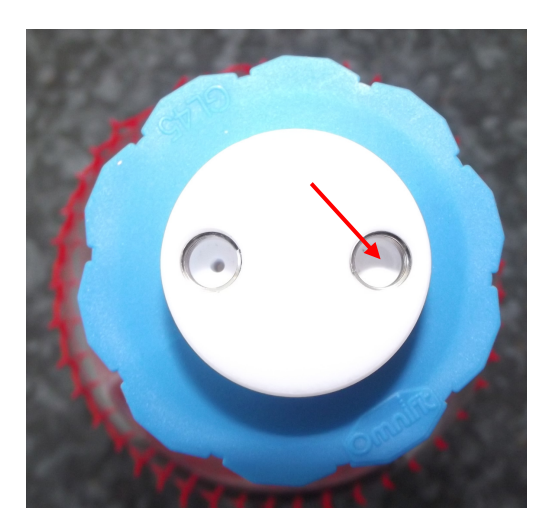
Figure 3: Sintered Disc fitted to Humidifier Cap.

Fit a 5.1mm diameter Sintered Disc 'Frit' into the remaining position using a rounded edge (such as a Trap Alignment Tool)