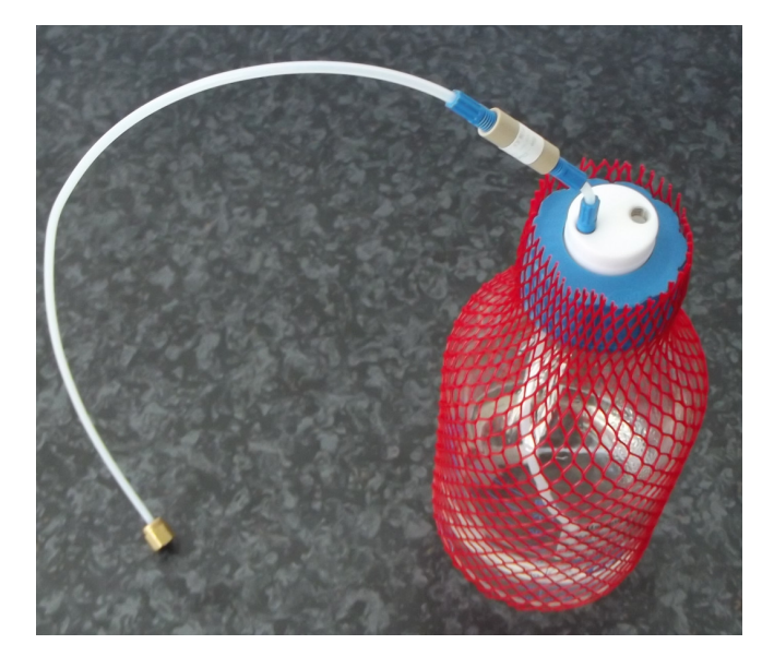
Figure 2: Connecting the Input Assy to the Humidifier Bottle. (NB – length of Tube is shortened to 200mm here.)

NB – This Tubing is supplied at a length of 1.00m, the ferrules supplied with the Tubing are not fitted to it hence the length of the Tubing can bed reduced if required.