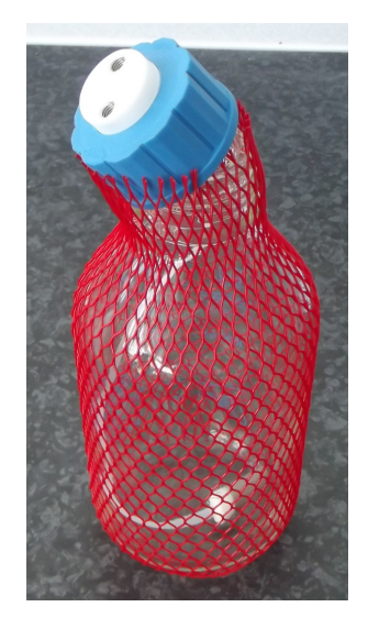
Figure 1b: Blue Cap fitted with Filter Bubbler inserted into Glass Bottle.