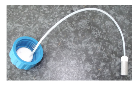
Figure 1a: Filter Bubbler fitted to Blue Cap.

Once fitted, fill the Bottle with water (Pure) between 200ml & 400ml and refit blue cap to the Humidifier Bottle.