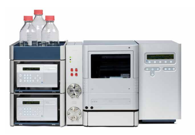
Figure 1: ALEXYS Kanamycin and Amikacin analyzer

The United States Pharmacopeia (USP) has two monographs describing the analysis of both Kanamycin [5] and Amikacin [6] using LC-PAD. The ALEXYS Kanamycin and Amikacin analyzer is a dedicated LC solution for the analysis of both antibiotics which matches the USP requirements for peak resolution, tailing and reproducibility. In this note typical results obtained with the analyzer are shown to demonstrate its performance.